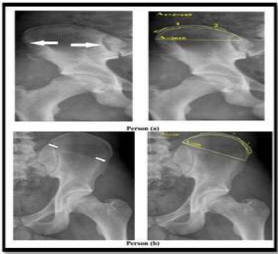
Figure 1: Anteroposterior view of pelvic bone X-ray showing Camerieres approach for age estimation by measuring the area of iliac crest apophysis (1+2) to area of iliac wing (A) in two persons.

The attainable results regard age estimation was assessed by applying the Cameriere's method showed measuring the area of iliac crest apophysis (1+2) to area of iliac wing (A) in two persons (Figure 1). By comparison of the ratio of iliac crest apophysis to the area of iliac wing (ICA/IW), the study results showed that there was a highly statistical significance increase in ICA/IW ratio among Group II compared to Group I (Figure 2).